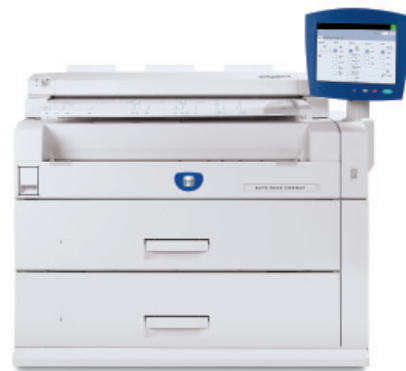
Copier/Printer with On-Board Scanner