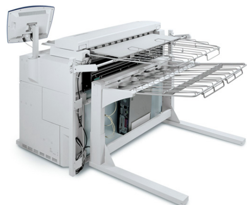
Optional Wide Format Stacker