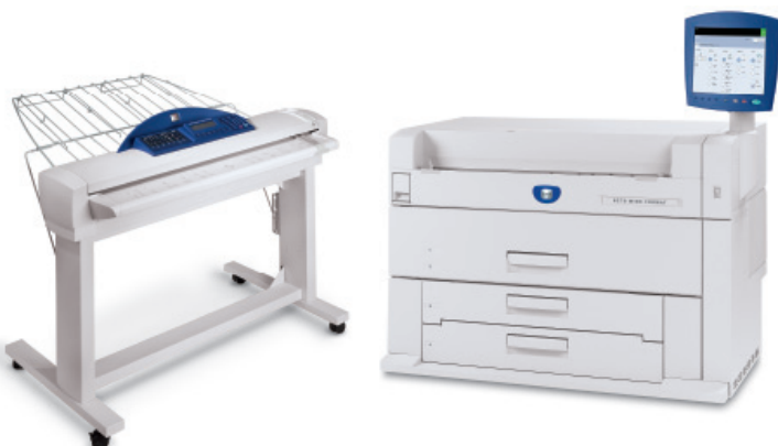
Multi-Function with Wide Format Scan System